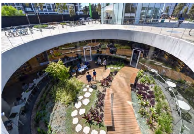
Green Square library

The City of Sydney's Green Square development is a modern, commercial and residential precinct that demonstrates sustainable high density living in practice.