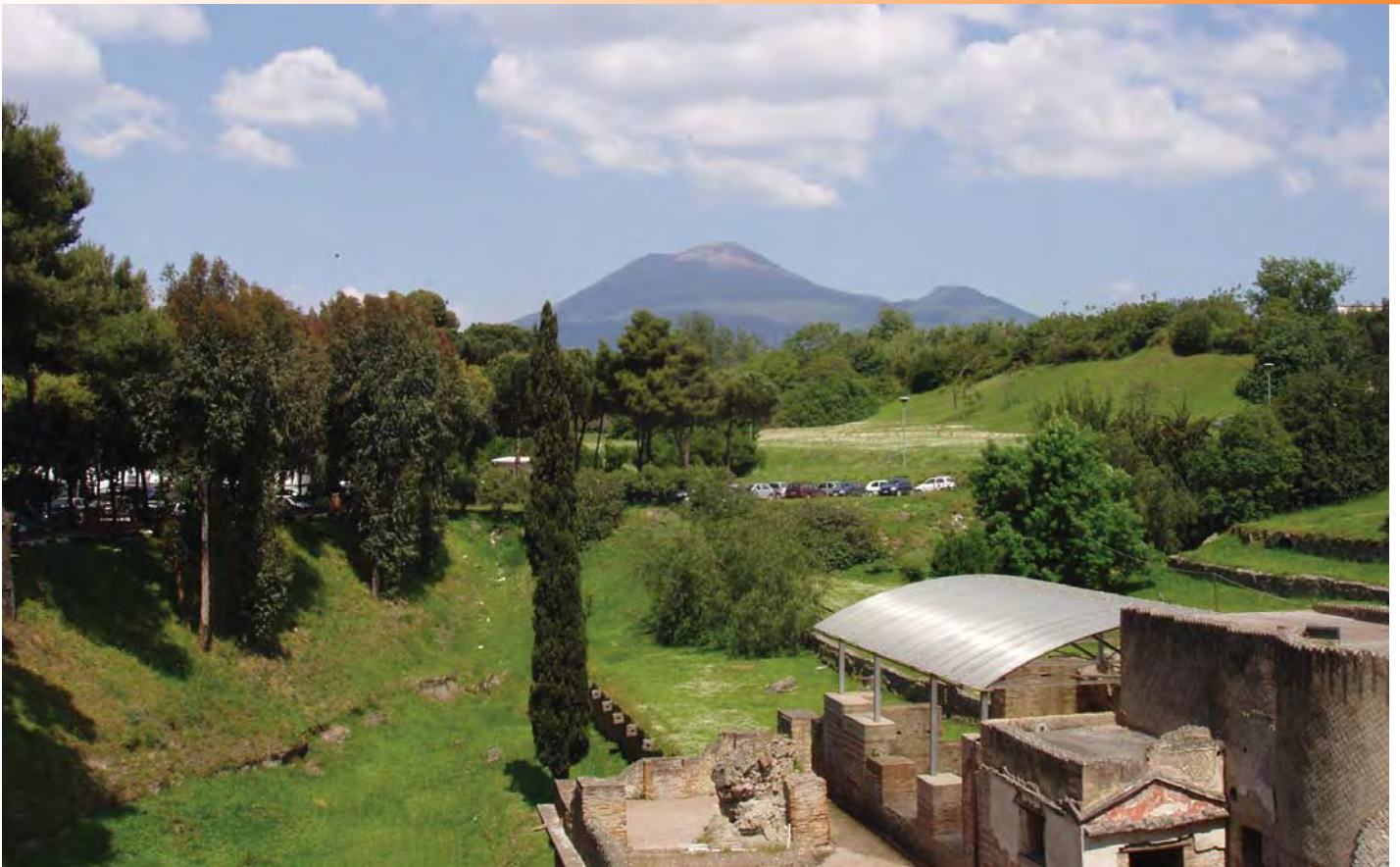
Mt Vesuvius viewed from the Pompeii archeological site.