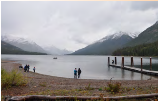
Waterton Lakes National Park, Peace Park and Biosphere reserve is an region of stunning beauty and diversity.