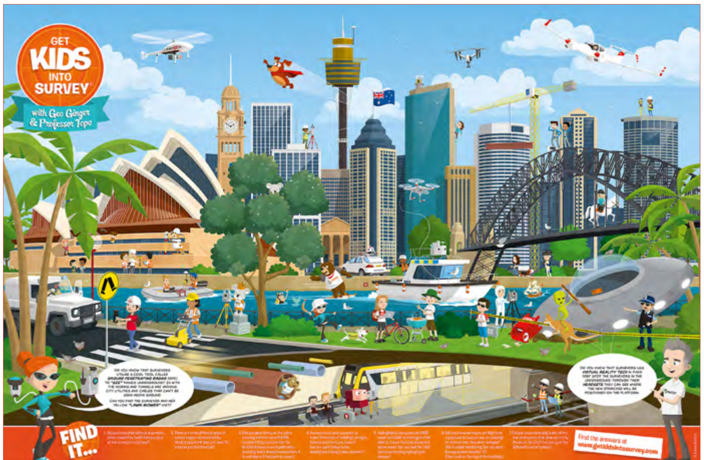
Get kids into survey – https://www.getkidsintosurvey.com/resources/