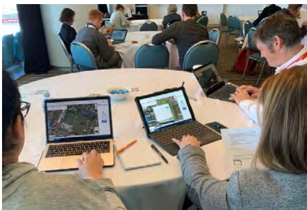
Hands on activities with SheMaps (Map My School)

A NEW opportunity in 2021 for schools unable to make the 2021 Annual Conference to access recorded presentations and resources. This applies particularly to schools in rural and regional centres where travel costs and shortage of casual staff limited teacher attendance. GTA are also aware that many schools will not yet allow teachers to attend a live event. See flyer following this report.