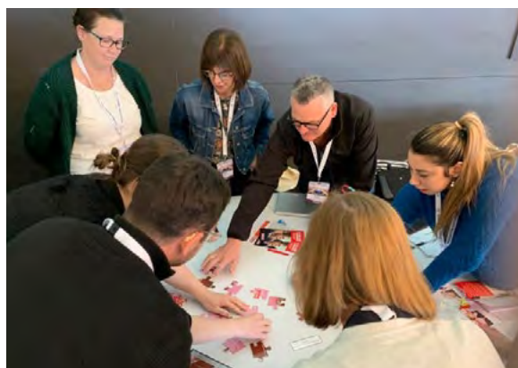
Hands on activities with Big Issue Classroom.