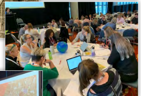
Below: HSC Marking workshop