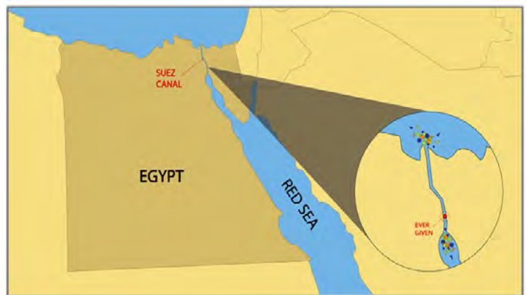
Map: of Egypt.