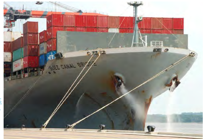
Suez Canal, Egypt.

The total volume of cargo being transported through the canal has increased steadily in recent years. This includes consumer goods, dry-bulk cargo such as grain and minerals, and oil products.