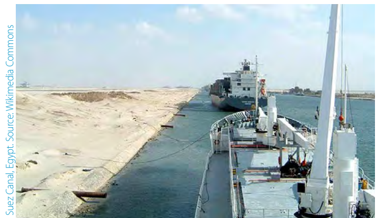
Suez Canal, Egypt.