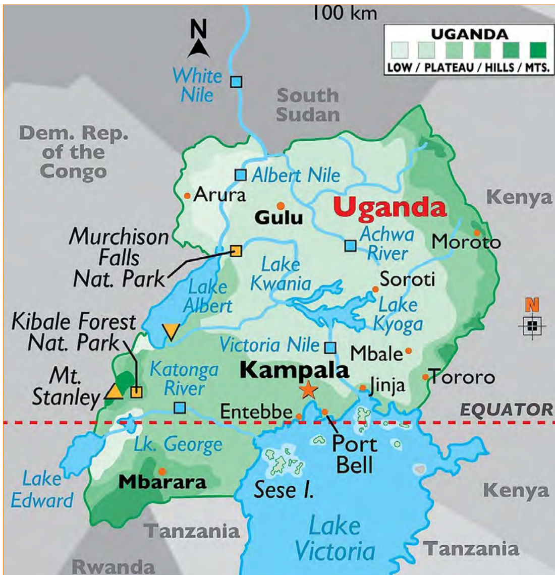
Uganda . Image Source: https://www.worldatlas.com/maps/uganda