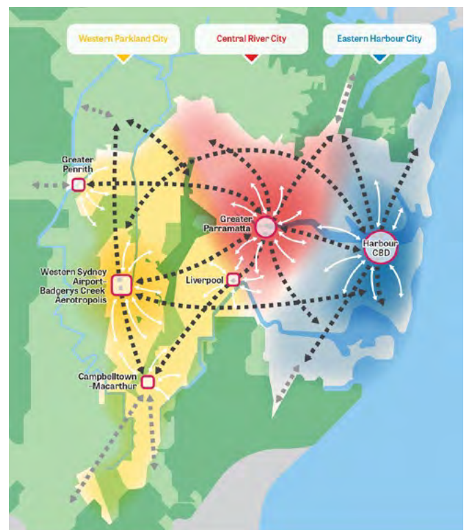
Source: Greater Sydney Commission. (2018) Greater Sydney Region Plan: A Metropolis of Three Cities, available: https://www.greater.sydney/metropolis-of-three-cities/vision-of-metropolis-of-three-cities