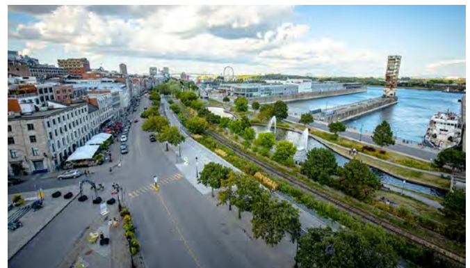
Urban planning, Montreal.