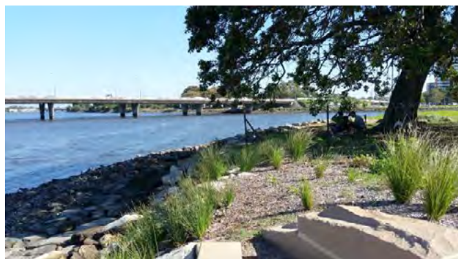
Natural creeks and rivers add to our enjoyment of a liveable city

To further investigate the importance of water to liveability visit Sydney Water's liveable cities page.