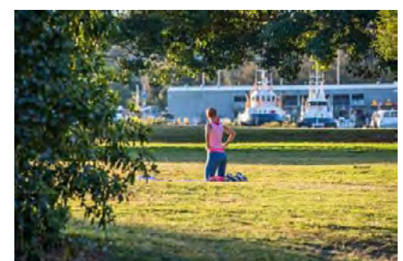
Parks and open spaces near waterways improve our wellbeing.