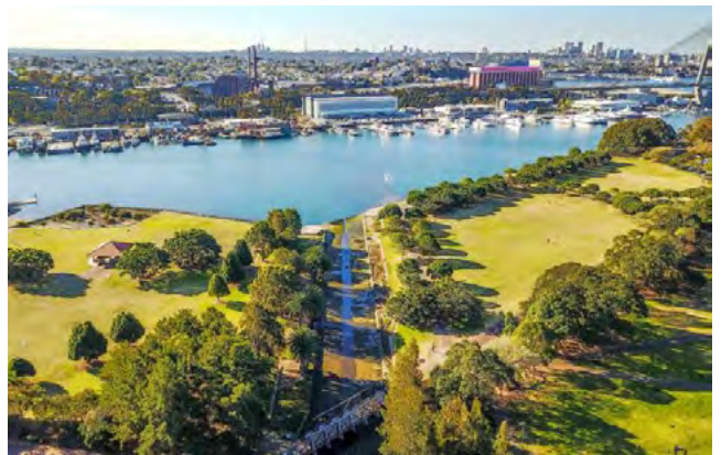
Water and recreational space

In Sydney we have access to clean, safe drinking water and the removal of wastewater (sanitation). That means our health and wellbeing are being cared for in the places we live.