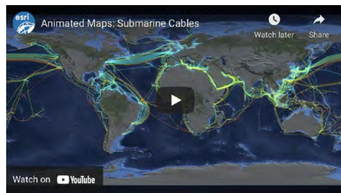
Animation of spread of global submarine cable network between 1989 and 2023. Hyperlink to https://www.youtube.com/watch?v=6dkiqJ_IJGw

The video below shows the incredible spread of submarine cables around the planet – with more than 885,000 kilometres of cable laid down since 1989. These cables cluster in narrow corridors and pass between so-called critical "choke points" which leave them vulnerable to a number of natural hazards including volcanic eruptions, underwater landslides, earthquakes and tsunamis.