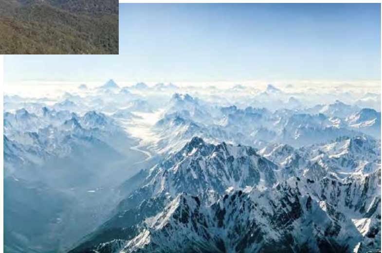
The Himalayas – Image source: https://unsplash.com/photos/zPlt1BhBEJI