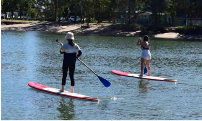
Paddle boarding on Currumbin Creek

As a small compensation for missing out on exploring Paris and the surrounding region, the students explored the Gold Coast and its hinterland – on the water, in the air and on the land.