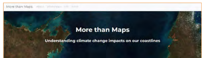
Figure 2: More than Maps workshops

For more information and to access the workshops visit the More than Maps website http://morethanmaps.earth .