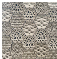
Front Cover - australiangeographic.com.au/news/2022/07/two-year-study-shows-living-seawalls-promote-regeneration-in-sydney-harbour/

Primary corporate membership and pre-service teachers FREE